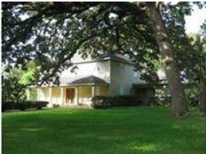
Mary Allen Heritage House (MAHH)

Mary Allen Museum of African American Art & History MAM