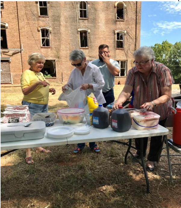
Volunteers from the First Presbyterian Church Provides Food For the August Community Work Squad