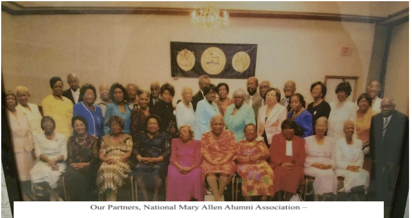
Our Partners, National Mary Allen Alumni Association – TOP DONORS OF THE YEAR